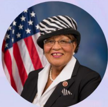
Special Guest: Congresswoman Alma Adams North Carolina District 12

The focus of this virtual summit is to provide a platform to discuss issues related to food justice and more importantly action steps to eradicate hunger in our community, state and nation.