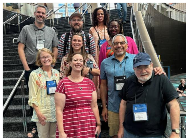
Salem Presbytery GA Commissioners