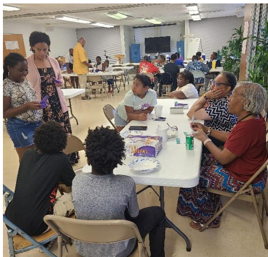
Game Night – July 16 th